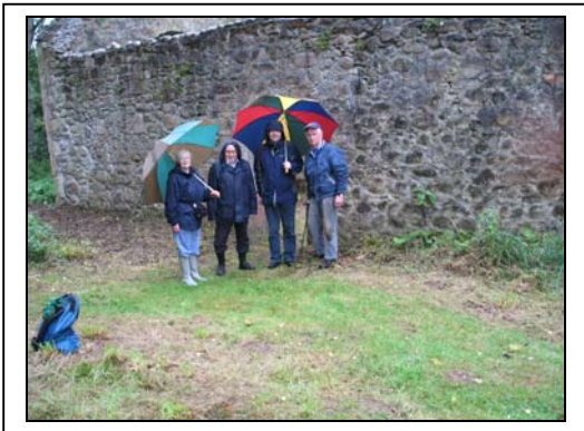
Members of the MAD Club after tombstone recording work at Altyre near Forres