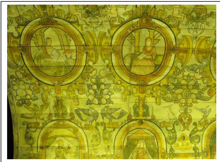
Painted roof feature