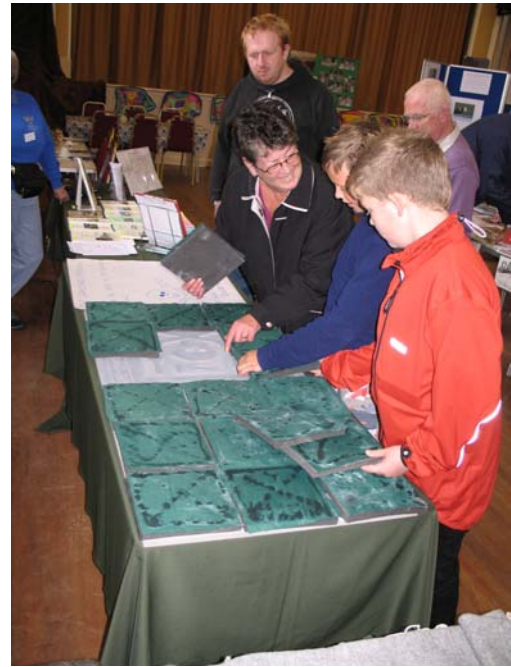
Right : The new MBGRG 'Gravestone Experience' in action at Lossiemouth Town Hall.