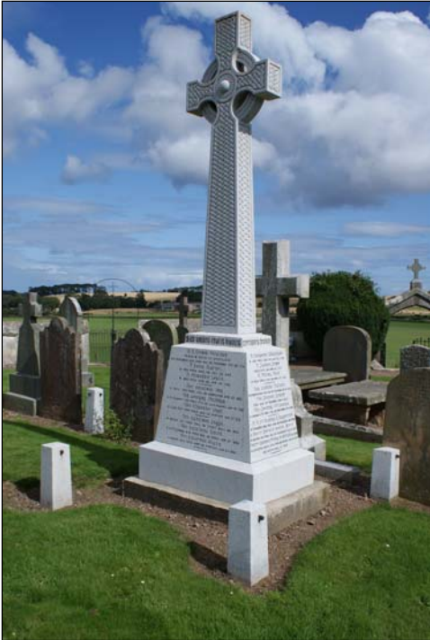
Memorial at St Ninian's to R.C. clergy