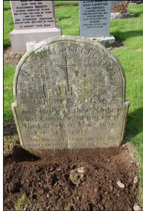
Important buried text at St Ninian's