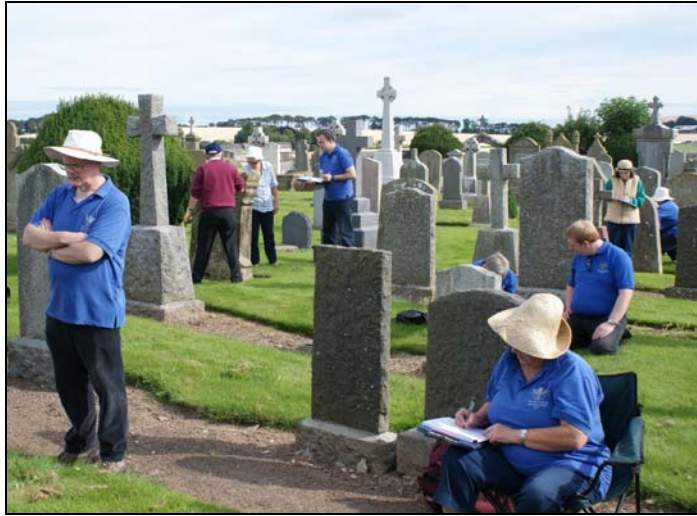
Above : MBGRG 2nd summer outing to St Ninian's, Braes of Enzie : Members hard at work

At the Forres Family History Fair on the 7th November, we were kept busy with quite a bit of interest shown in our activities. We gained three new members. Hurray!