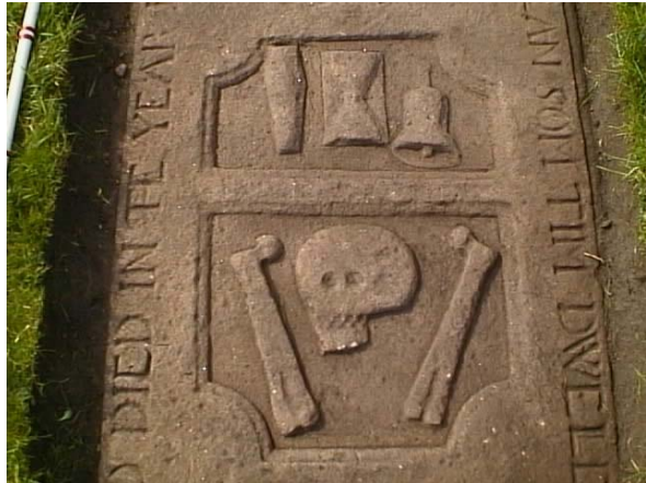
Well-carved, 18th century "Emblems of Mortality" at Kinneddar, including Coffin, Hour Glass & Deid Bell