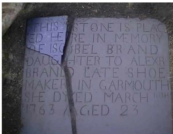
Beautifully carved slate gravestone of Isobel Brand, Garmouth, died March 10th 1763, aged 23