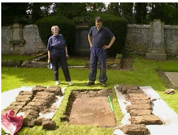
A Latin inscribed gravestone is revealed at St Andrews Kirkhill as we practice our new "Methodolgy"