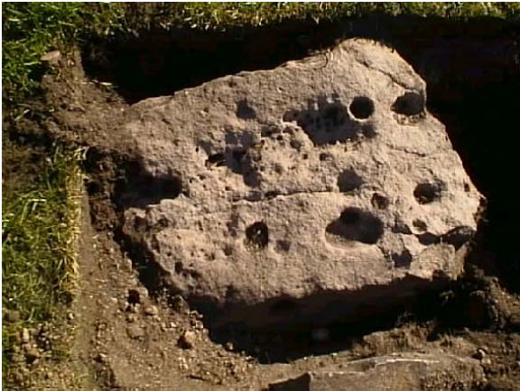
Mystery stone object at Kinneddar Note the square "socket" beside natural weathering