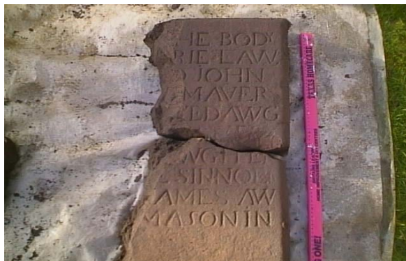
Fragmented gravestone at Essil showing damage possibly caused by 18th century "vandals"