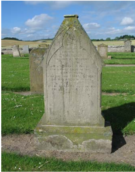
28 th June 2005