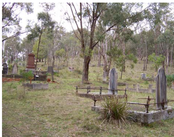
David Syme Memorial at Boroondara