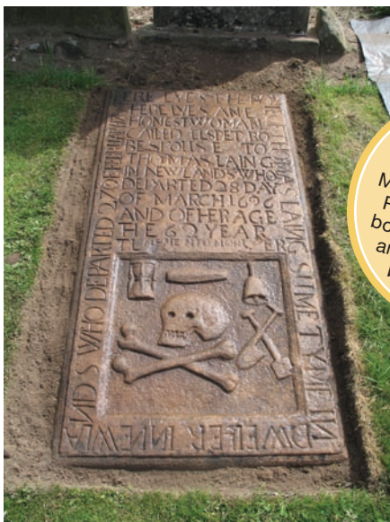
Water has enhanced this lovely 1696 stone at Spynie.