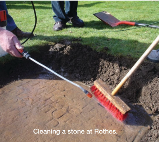
Cleaning a stone at Rothies.