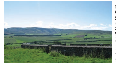
'The Loneliest Graveyard in the North-East' at Buiternach.