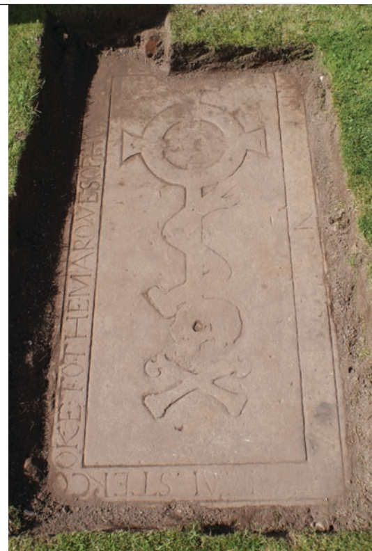
A Bellie gravestone with a cross and carved serpent.

Once the stone has been measured, fully recorded, drawn, and photographed, the area is backfilled with soil and the turf re-laid with each section in its original position. Soon there is nothing to indicate that the stone that lies beneath has been revealed for a very brief period of time, usually no more than 1-1½ hours from start to finish. The stones are always