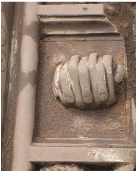
Praying hands at Dallas.

Emblems of mortality abound – skull and cross bones, skulls with a bone in the mouth, coffins,