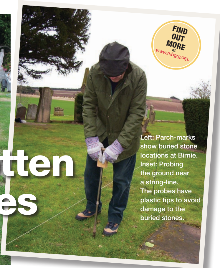
Left: Parch-marks show buried stone locations at Birnie. Inset: Probing the ground near a string-line. The probes have plastic tips to avoid damage to the buried stones.

Follow Mary Evans on the quest to find long-buried gravestones and record these treasures for the generations to come.