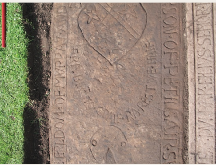
'Fra birt to graif na rest we haif', Alves 1571, now adopted as part of the group's logo.