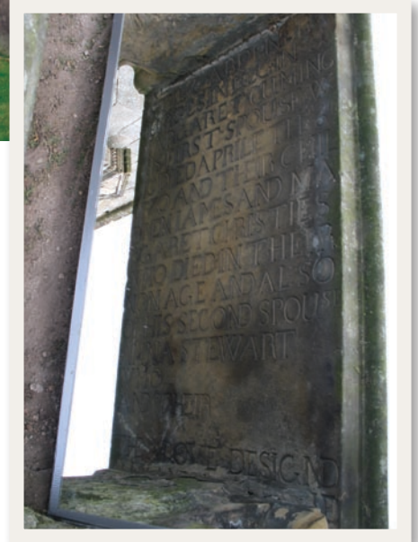
A mirror image of the underside of a table stone at Elgin Cathedral.

Find details of The Moray Burial Ground Research Group's booklet on page 61, and of Banffshire booklets too.